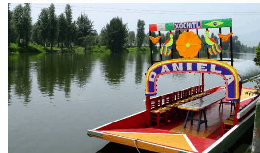
Xochimilco - Mexico City

Departs from Brownsville at 5:30a.m.; from Harlingen at 6:00a.m.; from Weslaco at 6:30a.m.; and from Mission at 7:00a.m.; or from your park with a specified number.