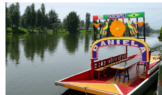
Xochimilco - Mexico City

Departs from Brownsville at 5:30a.m.; from Harlingen at 6:00a.m.; from Weslaco at 6:30a.m.; and from Mission at 7:00a.m.; or from your park with a specified number.